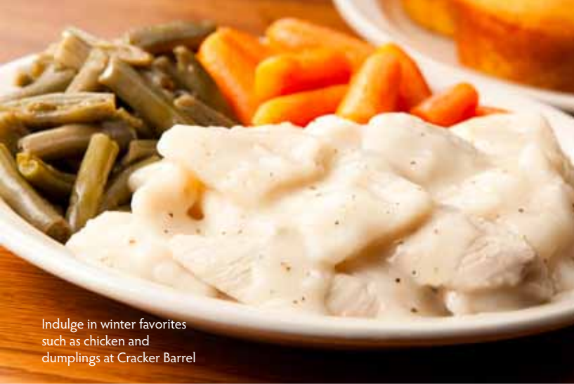
Indulge in winter favorites such as chicken and dumplings at Cracker Barrel