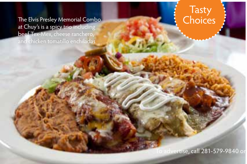
The Elvis Presley Memorial Combo at Chuy's is a spicy trio including beef Tex-Mex, cheese ranchero, and chicken tomatillo enchiladas