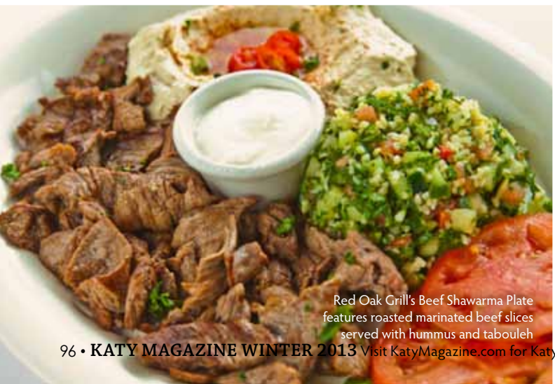
Red Oak Grill's Beef Shawarma Plate features roasted marinated beef slices served with hummus and tabouleh