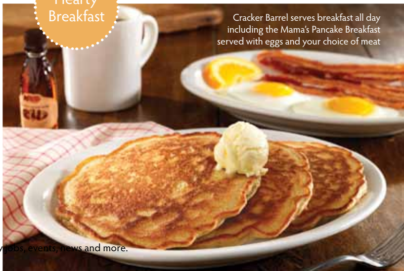
Cracker Barrel serves breakfast all day including the Mama's Pancake Breakfast served with eggs and your choice of meat