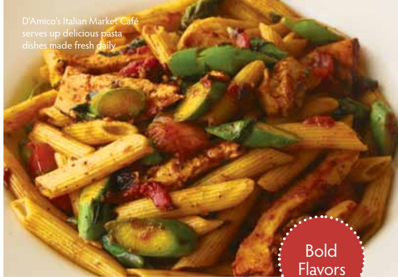
D'Amico's Italian Market Café serves up delicious pasta dishes made fresh daily